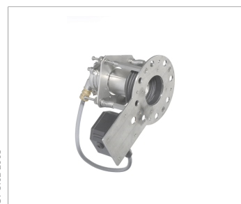
Dräger Pulsar 7000 Duct Mount