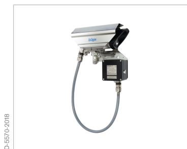
Dräger Pulsar 7000