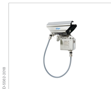
Dräger Pulsar 7000 Heavy Duty